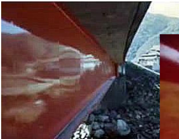
First painted in 1993

“The world’s first solvent soluble fluoropolymer coating was developed over 40 years ago. This same chemistry is now at the forefront of protective coating technology today and it’s due to the extremely durable nature of fluoropolymer coatings. Essentially, they are unaffected by UV light, the “killer” of all other coatings and paints. Chemically, a fluoropolymer coating is a fluoroethylene-vinyl ether alternating copolymer also known as FEVE.”