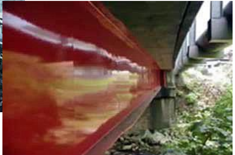
2008 paint looks the same after 17 years (right)