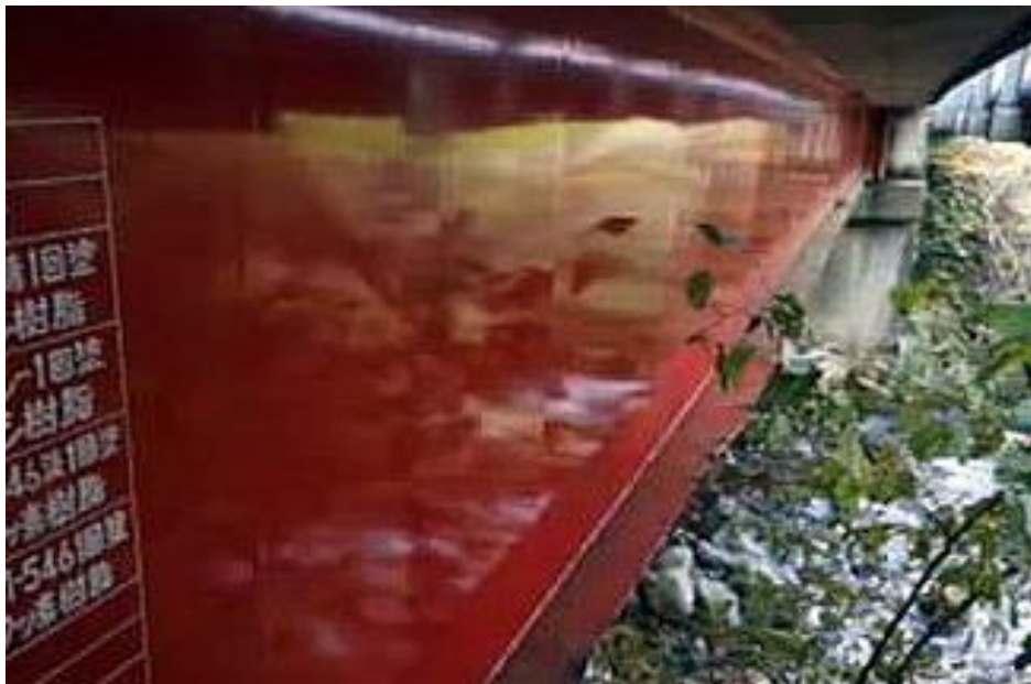
2016 after 23 years no signs of UV or any other damage (left)